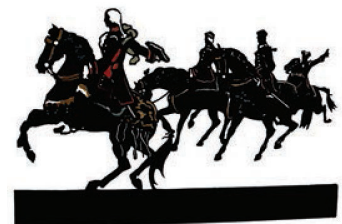
1. Shadow Theatre and cut-outs