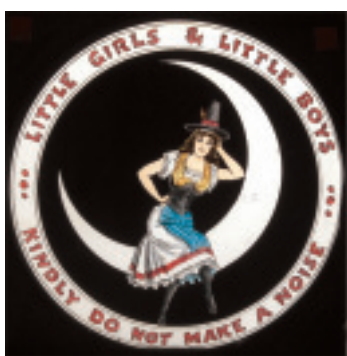
Two of the fiendish quiz questions (with the missing words revealed)