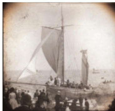
Skylark trips from Brighton

The day ended with Alan and Rene Marriott with Suzanne Higgins (providing the music) giving us a selection of songs and magic lantern images all related to being on the water. These included the