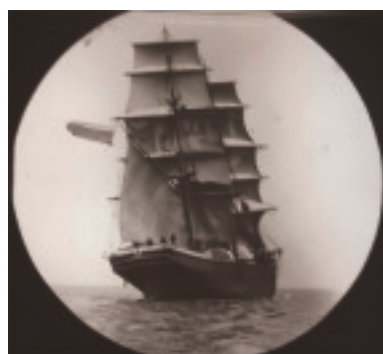
A clipper ship from the race