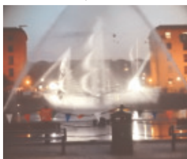
Liverpool's ghostly galleon projection