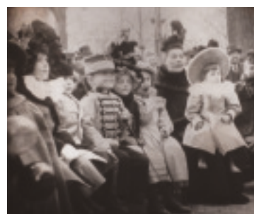
An appreciative MLS audience

Answer to the question: 13/6d (67.5p for younger members)