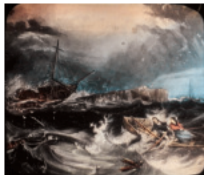
Grace Darling in action

RMS Olympic , sister ship of RMS Titanic , but a survivor of collisions, was followed by a tale about a couple of fishermen. One caught a large fish who pulled him out of the boat to the bottom of the water but the fisherman prevailed in the end to see his 'long snouted rock devil' on display. We