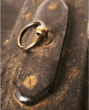
A travelling showman from a Dutch long slide c.1800, and detail of the hook