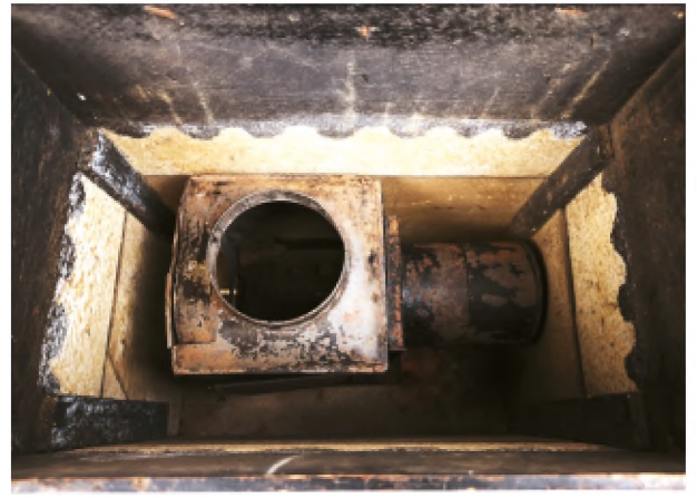
Inside the box. Looking down (note the border pattern) (left) and with the tray lifted out (right)

The lantern still holds some secrets. Unlike Roger's example, there were no slides in the box. The lanternist would almost certainly have projected long slides at this time and you might expect these to be stored in the tray at the top of the box. However, no known format of long slides produced in Germany or nearby at that time appear to fit easily into the tray. One possibility is that the tray was used for other equipment and the slides