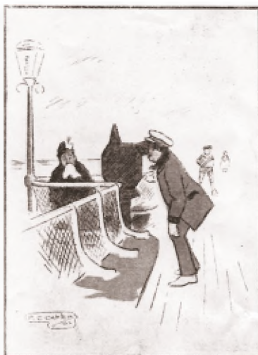
(Sketched on the pier just after the arrival of the boat.) "Arry (viewing stormy sea in a mutoscope). "My eye, Maria, come an' 'ave a look 'ere. The motion of the waives is simply grand!"