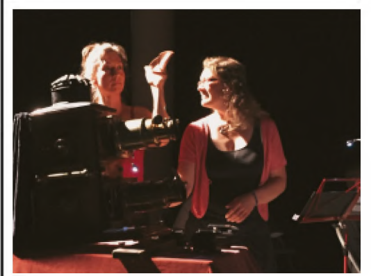
The return of the Muckle Flugga Magic Lantern Company in Exeter (see p.15)

But before that, our own 11th International MLS Convention is in Birmingham from 29 April to 1 May 2022. More details are contained in the Convention brochure mailed with this edition of TML . Make sure you save the date and join us if you possibly can. Come and enjoy some wonderful shows and events as well as catch up with friends old and new.