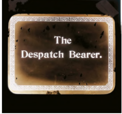
Introduced Mitchell and Kenyon's The Despatch Bearer, released in May 1900. This was a fictional film (the others in the Hiley are all non-fiction) and showed a British despatch bearer under attack by the Boers – although it was actually filmed just outside Blackburn. On the right is a still from the film. in the BFI collection.