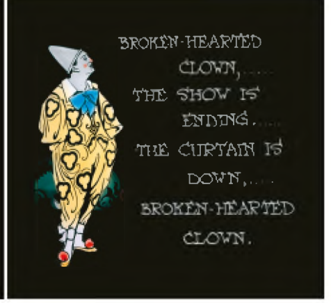
Slides from the illustrated song set