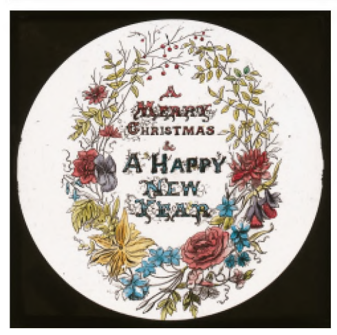
Magic lantern slide