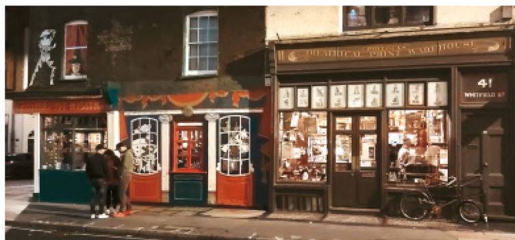
Pollocks Toy Museum, on the corner of Scala and Whitfield Streets, London

On Saturday 30 October we went along to Pollocks Toy Museum in Scala Street/Whitfield Street, London, for a very special magic lantern show. While this small museum had been a favourite haunt when our children were young, more recently we have not had such a good excuse to visit – until Frog Morris and Nicole Mollett mentioned at the MLS Autumn Meeting that they were putting on a show there. In all they put on four shows – two on the Friday and two on the Saturday – as well as running a series of three workshops on the Thursday for people of all ages to make their own magic lantern slides.