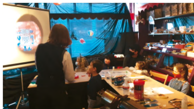
Frog projecting a finished slide for a proud artist