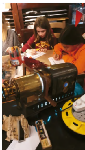
Hard at work in one of the workshops