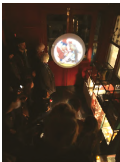
Part of the show in an upstairs room, with Punch and Judy slides