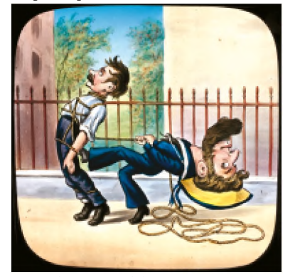
From The Rope Trick