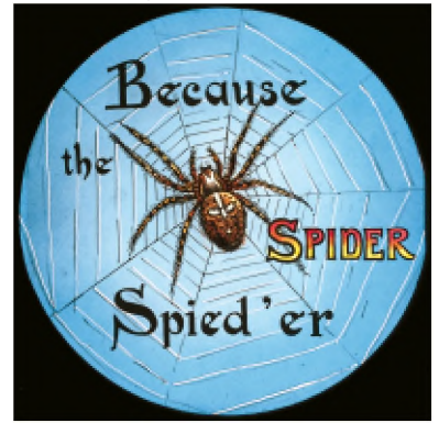
The answer to 'Why did the fly fly?'