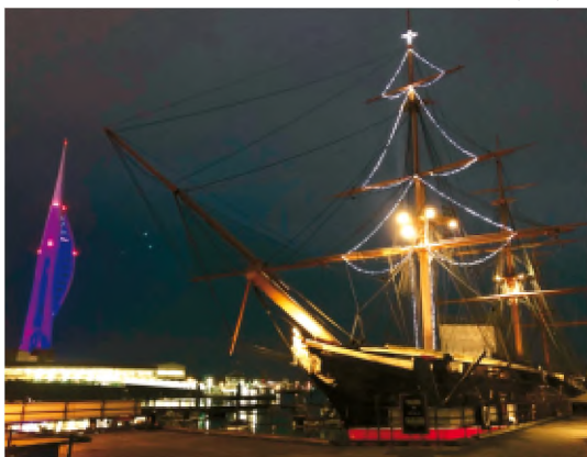
HMS Warrior ready for Christmas

In 1863, under the command of Captain Cochrane, HMS Warrior completed a 2,600 mile tour of Great Britain, inviting visitors on board at every port. There was enormous interest everywhere they called in. This was the time recreated on 3 and 4 December 2022 when people were invited aboard as the crew