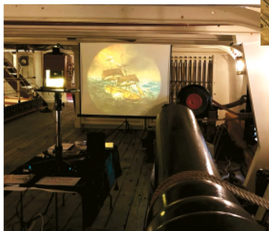
A cannon's-eye view of the show (left)

A suitably-dressed early visitor to the show (left). I was asked to include the 'man eating/swallowing rats' slide as there were plenty of rats on board in 1863. I told the visitors that the 'man' was the Captain of the ship!