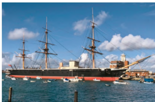
HMS Warrior today in Portsmouth dockyard