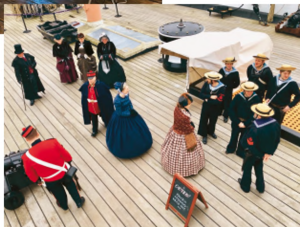
The ship's company and 'guests' in 1863 costume (right)