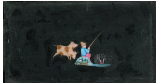
Bull & Fisherman