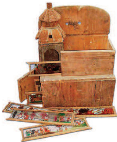
The Savoyard box – old and new