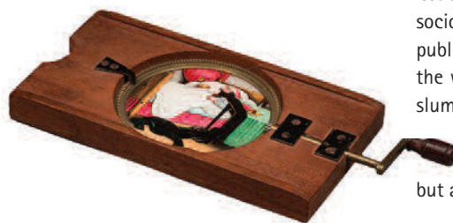
Magic lantern entertainment given to 1,450 poor and destitute children by the members of the Fulham Liberal Club and Institute

Historische Projektionskunst und Soziale Frage