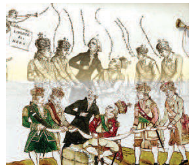
La Quadruple Alliance political cartoon and La Liberté des Mers slide