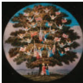
Heart of Oak