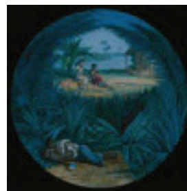
The fugitive slave dreaming