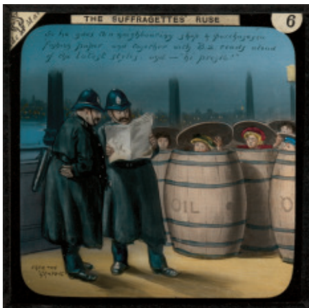
6. So he goes to a neighbouring shop and purchases a fashion paper and together with B2 reads aloud of the latest styles and – "hi presto!"