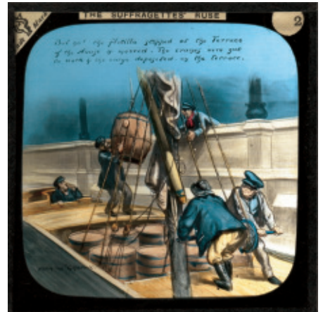
2. But no! The flotilla stopped at the Terrace of the House and moored. The cranes were got to work and the cargo deposited on the Terrace