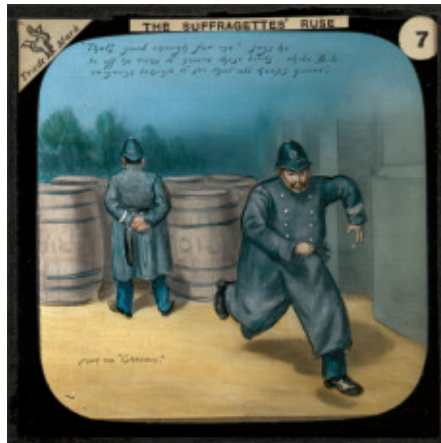
7. "That's good enough for me" says he. So off he runs to snare these birds while B2 remains behind to see that all keeps quiet