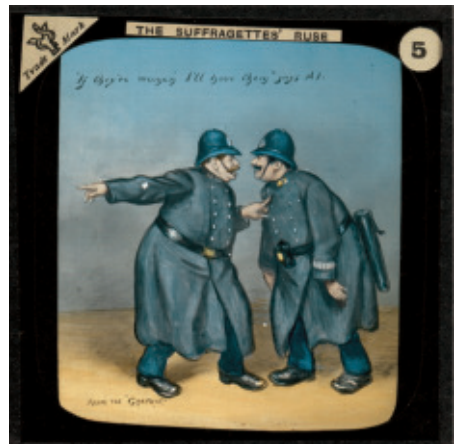
5. "If they're women I'll have them" says A1