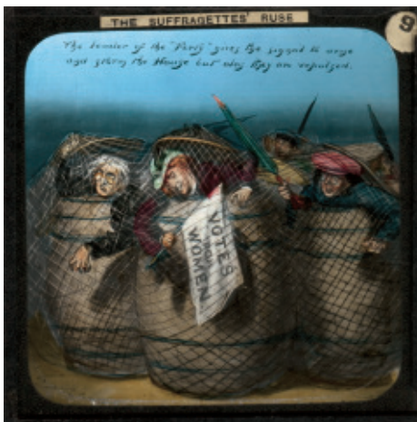
9. The leader of the 'Forty' gives the signal to arise and storm the House but alas they are repulsed