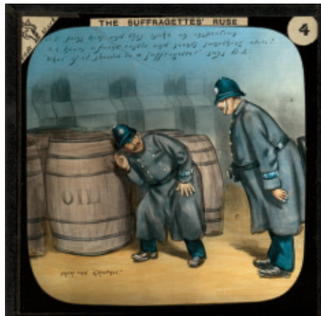
4. B2 joins him and they make an inspection. A1 hears a faint rustle and scents something alive. "What if it should be a suffragette?" says B2