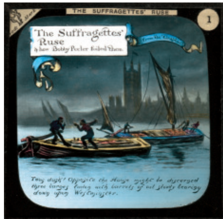
1. 'Twas dusk. Opposite the House might be discerned three barges laden with barrels of oil slowly bearing down upon Westminster