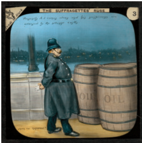
3. Presently A1 comes along and his suspicions are aroused by the strange casks