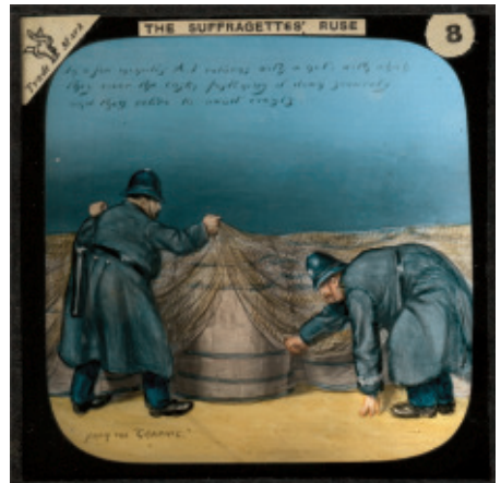
8. In a few minutes A1 returns with a net, with which they cover the casks fastening it down securely and they retire to await events