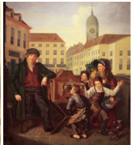
Peepshow with peg-leg showman – no further details known