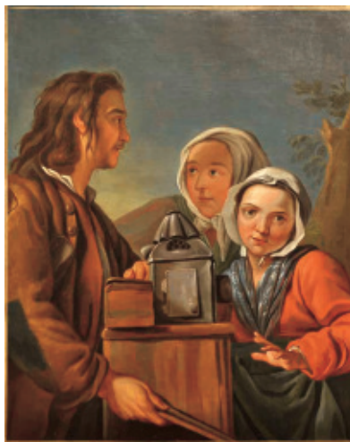
La Lanterne Magique by Jean-Baptiste Marie Pierre (French, 1714-1789), c.1750