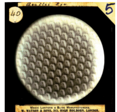
11. Multiple images of Queen Victoria as seen through a 'beetle's eye'