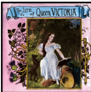
10. (a) Title slide from a 'life of' set. (b) A popular image of the Royal Family from a transfer set