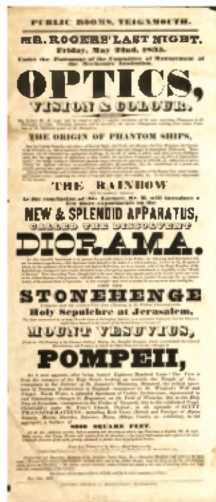
The Teignmouth poster, 1835