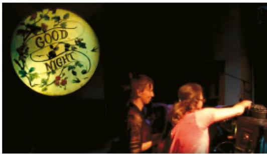
The Muckle Flugga Magic Lantern Company