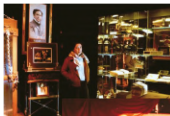
The 'House of Mysteries' in Ghent, April 2021