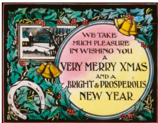
Tyler Apparatus Co. Ltd, Charing Cross Road, London

We hope all MLS members have a wonderful festive season this year, and we hope many will be giving magic lantern shows – don't forget to send us pictures and information that we can feature in the next issue of TML . You will find a few more seasonal items in this issue. This slide has no visible information about it – but is a heartfelt message!