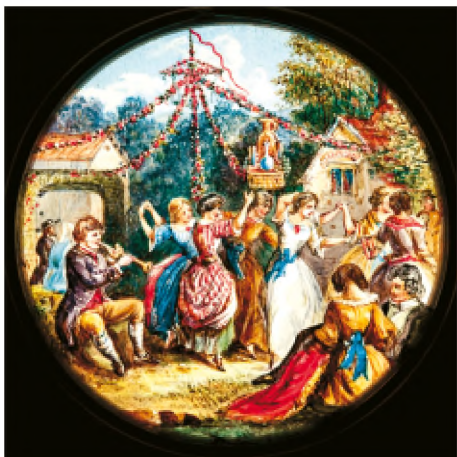
Two more slides that were used in Herman Bollaert's Galantee Show. A rural scene of maypole dancers (left) and possibly Flora (right). No makers' names or labels on the slides (Ditmar Bollaert)