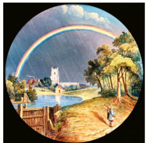
An April shower – part of a dissolving view. No maker's name or labels (Mary Ann Auckland)