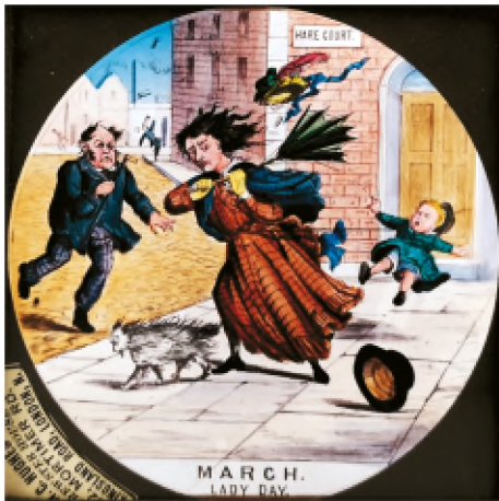
'March. Lady Day' – problems with the March wind. From a set of the 12 months of the year, W.C. Hughes, London